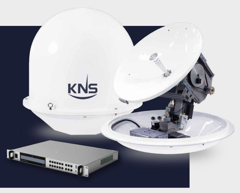
*Design is subject to change without notice

The SuperTrack Z-Series is the perfect solution for ships looking for broadband speeds at sea. Stay in touch with your networks via high speed access to the internet, email, multiple VoIP phones and more.