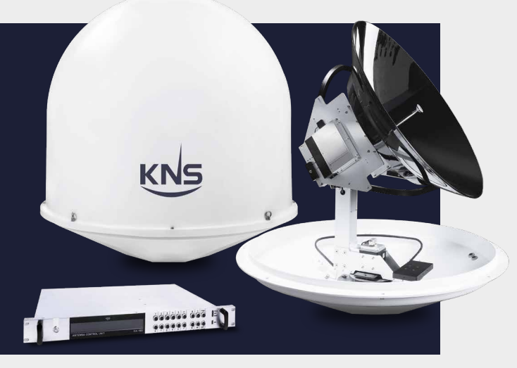
*Design is subject to change without notice

The SuperTrack Z-Series is the perfect solution for ships looking for broadband speeds at sea. Stay in touch with your networks via high speed access to the internet, email, multiple VoIP phones and more